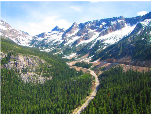
photo ops at Washington Pass and Diablo Overlook.

throp. Once there, lunch was enjoyed at Three Fingers Jacks followed by the museum and ice cream. The trip back across the pass included