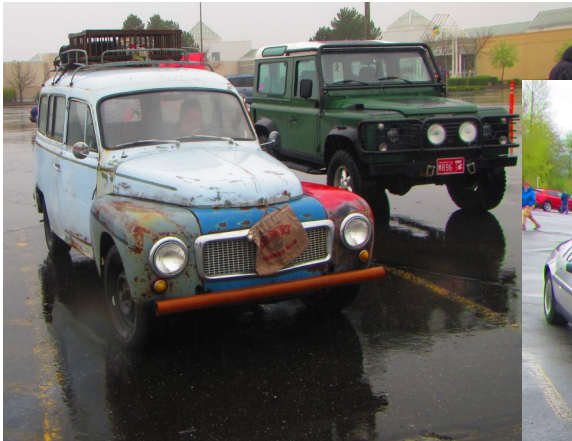
Both of these are too cool!