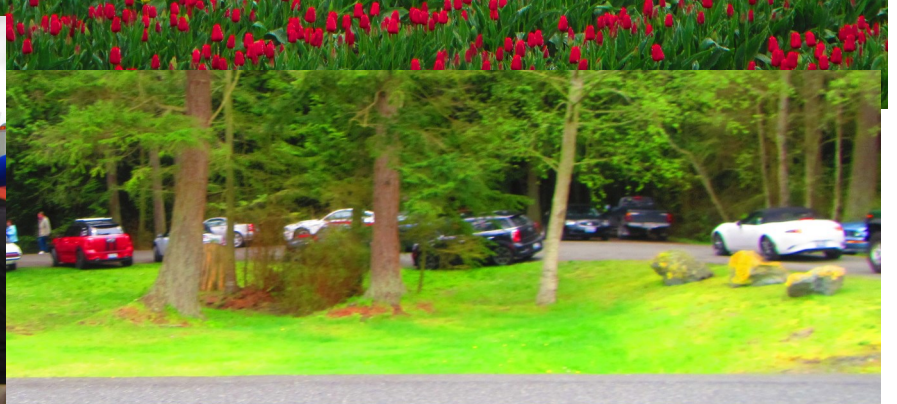
A stop along the Tulip Rallye