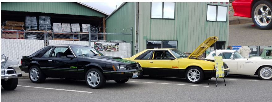
The Grams' Alternate COBRA and 79' COBRA